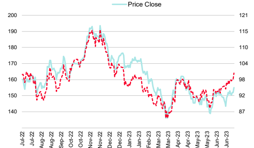
PTT Exploration & Production (PTTEP TB)